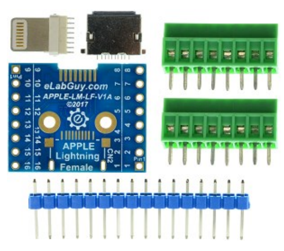
Figure 1: Parts inside the kit (Note: the module is not assembled, user can decide which connector to use on the module.)