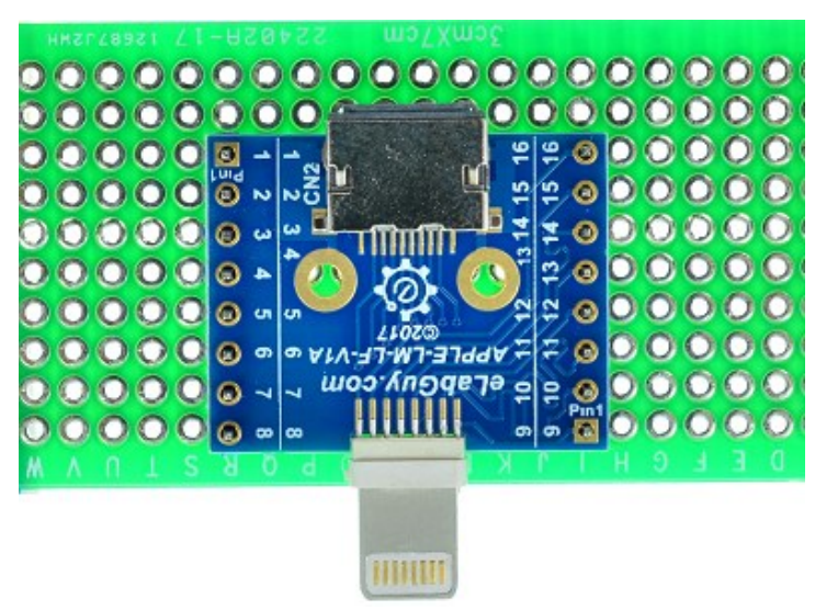
Figure 5: Solid Mounting on prototype PCB