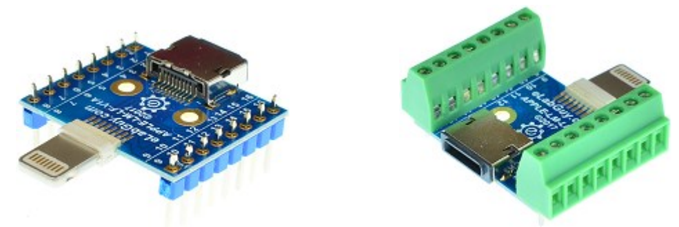
Figure 3: APPLE-LM-LF-V1A Various connections